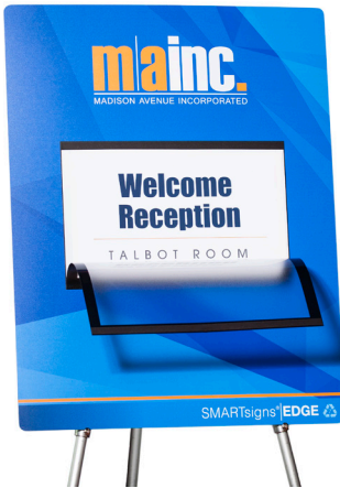
Add a SMARTlens® for more control.

The EDGE sets the new standard for extreme durability in a lightweight package. Unique black edge and core. Your best long-term investment. Will last years.